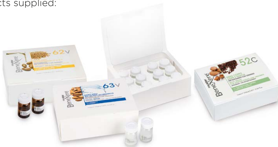
62V Pack of 12 BeneXere Multivitamin Face Serum Vials