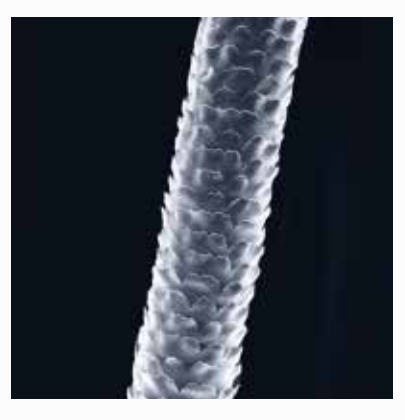
Hair structure after applying the porosity equaliser